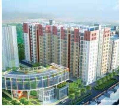
Before Toll Plaza Ajmer Road Jaipur Affordable flats on Jaipur-Ajmer Expressway