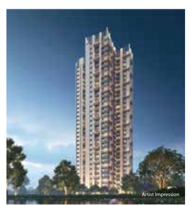
EM Bypass 3.5 | 4 | 4.5 BHK and Duplex