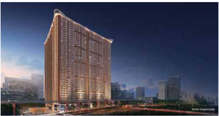
Beside GTB Nagar Monorail Station SION NX