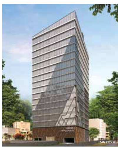
Chowringhee adjacent to Metro Central Kolkata Premium and customised office spaces

siddha.group/projects/ siddha-happyville-jaipur HIRA Regd.