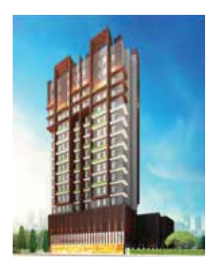
Malad (E) Mumbai

50,000 sq ft. Space Housing all group companies under one roof