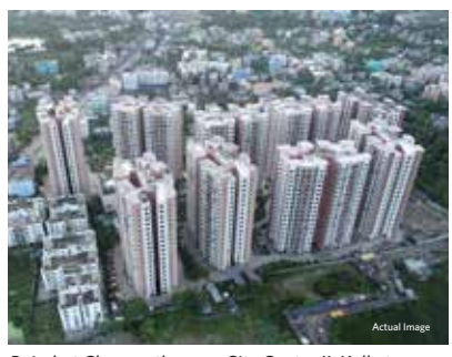
Rajarhat Chowmatha near City Centre II Kolkata 3-side-open apartments • 30,000 sq ft Club